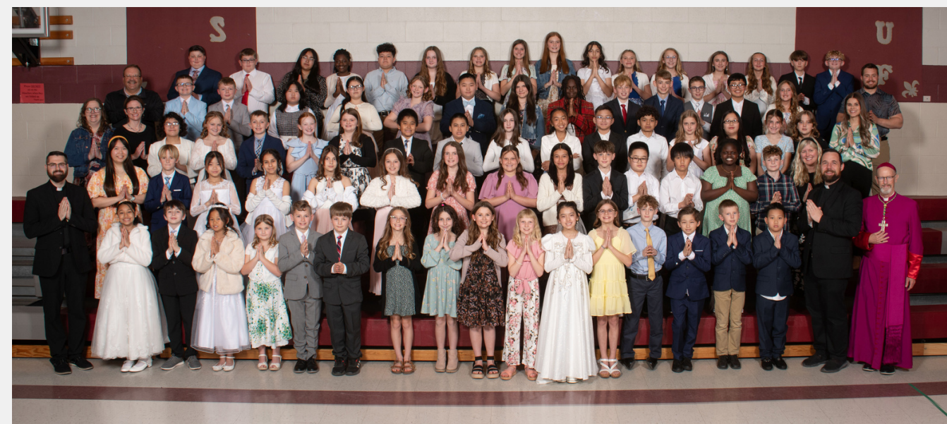
CONFIRMATION APRIL 11, 2024

Congratulations to our NAM School and CCD 2nd Grade & 5th Grade students for receiving the sacraments of First Communion and Confirmation. Thank you to all the parents, faculty and staff that helped prepare these students for such a special day!