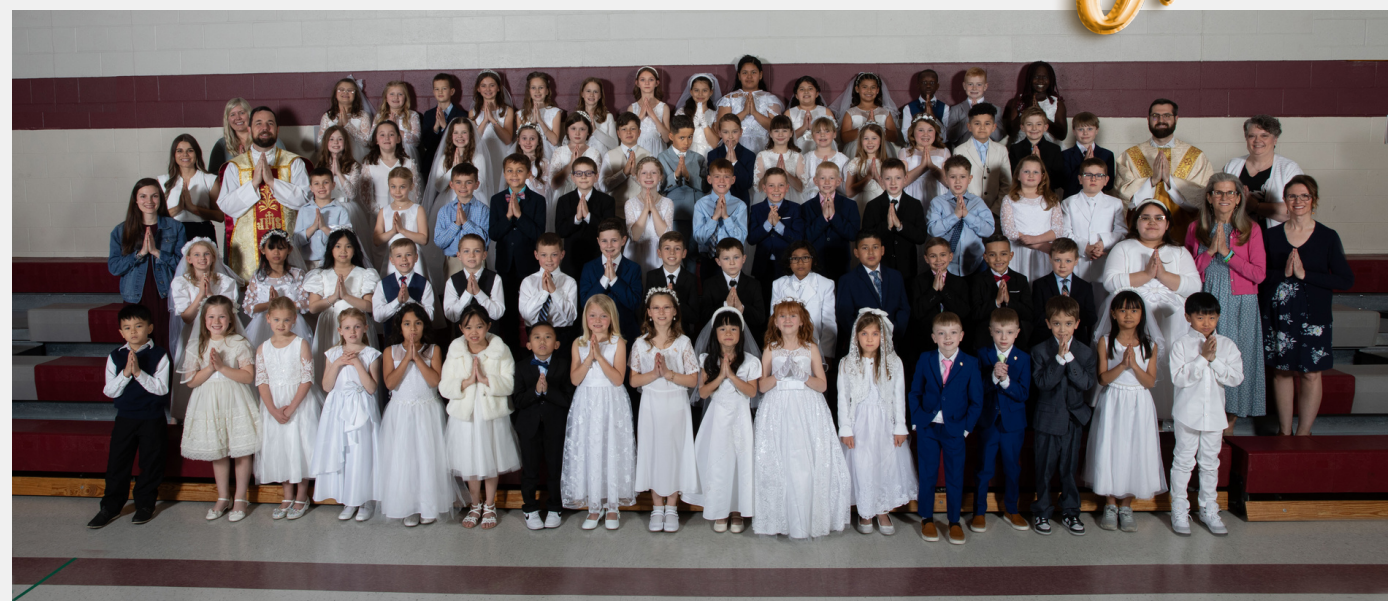
FIRST COMMUNION APRIL 2, 2024