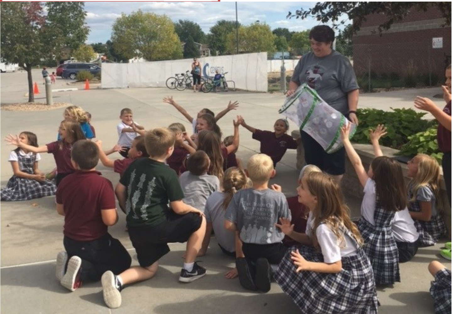
Above: Second grade releases their butterflies after reading The Hungry Caterpillar .