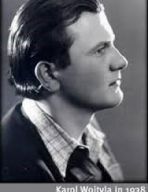
Karol Wojtyla in 193