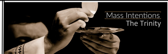
Mass Intentions The Trinity