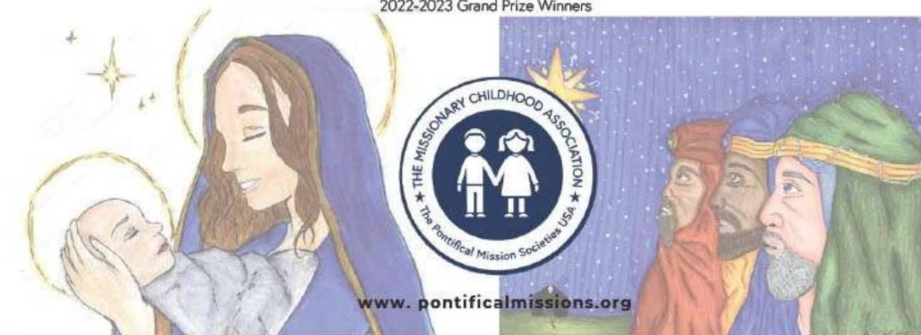
2022-2023 Grand Prize Winners