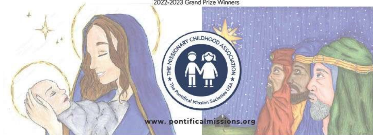
2022-2023 Grand Prize Winners