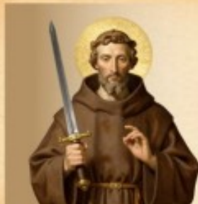
The Battle Against Evil in the Spirit of St. Francis